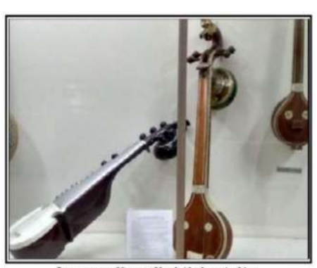
Instruments of Sangeet Natak Akademy Archive