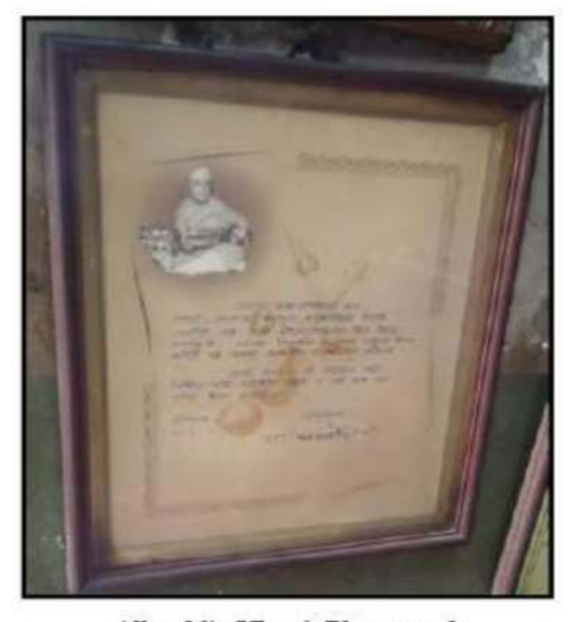
Allauddin Khan's Photograph