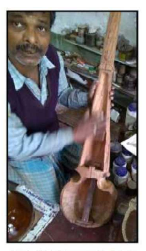
Describing the importance of proper chiselling