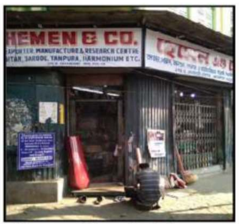
Entrance of Hemen Sen's shop near Triangular Park, Kolkata