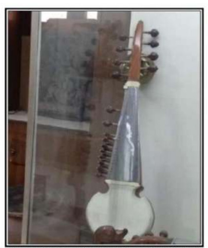
Maihar style Sarod kept in Sangeet Natak Akademy's Archive