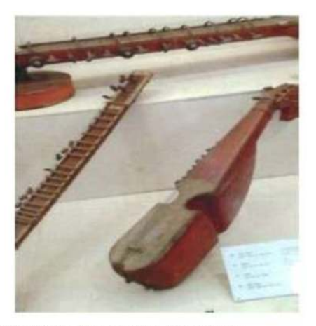
VIEW OF DIFFERENT INSTRUMENTS IN NATIONAL MUSEUM