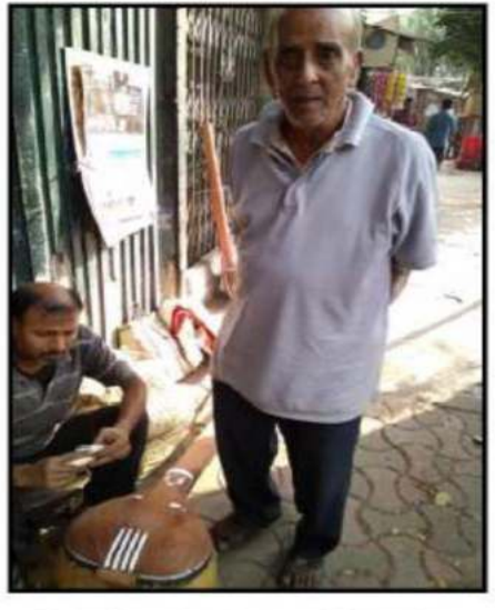
Experienced artisans of Ratan Sen